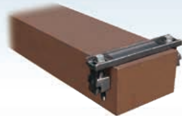
For Connection-part, With joint bar.