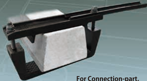
For Connection-part, With joint bar.