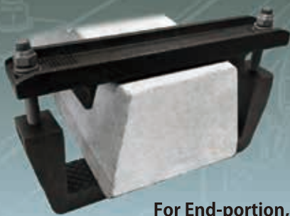
For End-portion, Without joint bar.