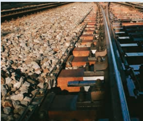
For End-portion, Without joint bar.